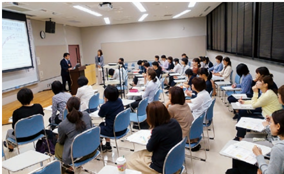
Training sessions for professionals in health-related fields working for the prefecture and municipalities

At the Health Promotion Center, we use the FDB (Fukushima Health Database) to create annual reports on the state of medical care and examinations. We plan to continue creating such reports based on the data accumulated in the FDB. In terms of supporting the development and training of human resources, in addition to holding training sessions for specialists in social medicine, we also hold various training sessions several times a year for professionals in health-related fields working for the prefecture and municipalities. We also hold the "Ikiiki Kenko-zukuri Forum," which translates to the "Vibrant Health Promotion Forum" and is an event to enlighten prefectural residents about the importance of maintaining one's health.