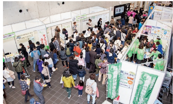
"Ikiiki Kenko-zukuri Forum" in Shirakawa City