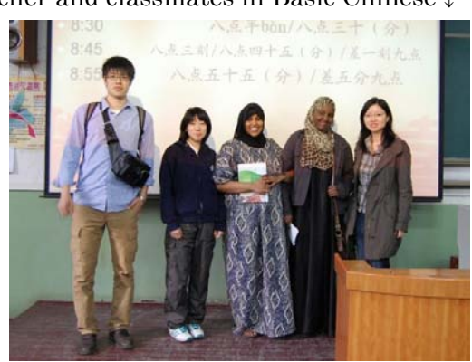
Teacher and classmates in Basic Chinese \