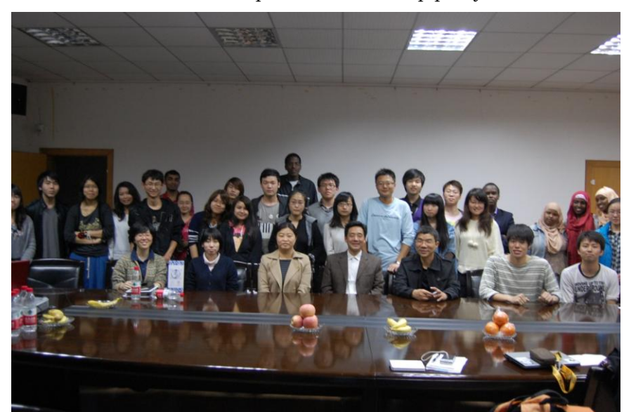
↓ A commemorative photo at friendship party

On April 16th, the friendship party between Chinese students and Japanese students was held in the administration office. International students were also invited to the party. Chinese students introduced us the history, culture and new education system of Wuhan University. We made a presentation about Fukushima prefecture, Japanese culture, medical education system in Japan and the earthquake disaster last March. After the presentation, they presented each of us a school batch of Wuhan University and beautiful bookmark.