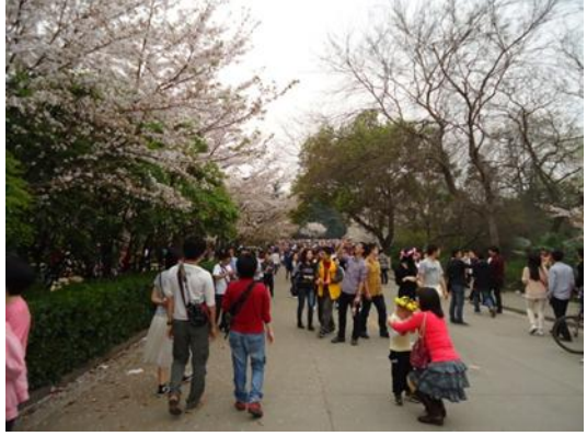
† Cherry blossom street in main campus

The medical campus where we stayed is apart from the main campus. It is 20-minute bus ride from the main campus. The medical campus has also a cherry blossom street named "櫻花通". At the end of March, cherry blossoms began to come out and students took photos of them. ↓ Cherry blossom street in medical campus