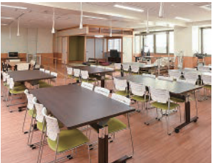
Everyday Life Activities Workshop Room