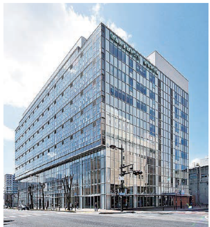
Fukushima Medical University School of Health Sciences