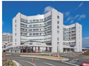
Fukushima Life and Future Research Medical Center Building

Sycamore trees (plane trees) are called Hippocrates trees, from the legend that the great doctor Hippocrates taught medicine in the shade of a tree. This tree is known as a symbol of medical universities, but the sycamore tree here at Fukushima Medical University comes from Kos Island in Greece, the origin spot for this legend.