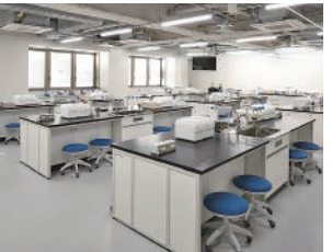
Analytic Chemistry Testing and Workshop Room