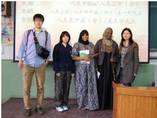
Teacher and classmates in Basic Chinese ↓