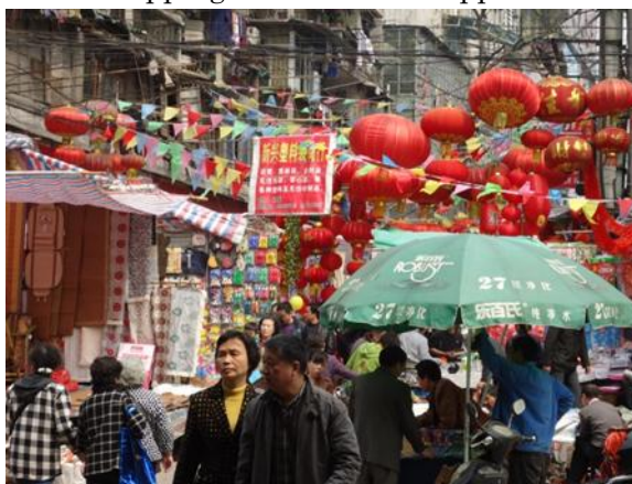
↓ The shopping district on the opposite bank