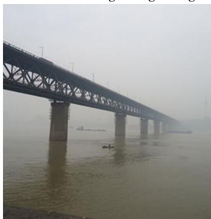
↓ Wuhan Chang Jiang Bridge