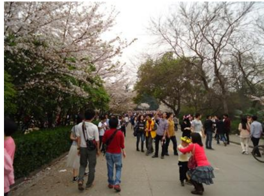
↑ Cherry blossom street in main campus

The medical campus where we stayed is apart from the main campus. It is 20-minute bus ride from the main campus. The medical campus has also a cherry blossom street named “櫻花通”. At the end of March, cherry blossoms began to come out and students took photos of them. ↓ Cherry blossom street in medical campus